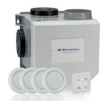
All-in-one ventilation package, CVE-S ECO and RFT white