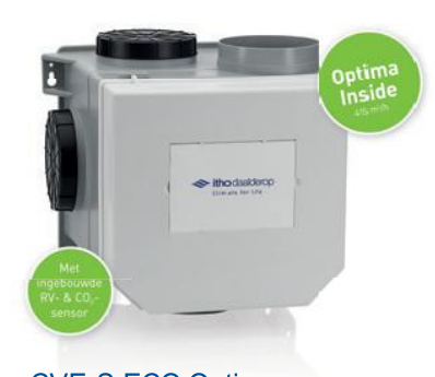
CVE-S ECO Optima