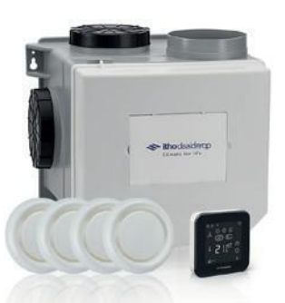
All-in-one ventilation package, CVE-S ECO and Spider Base